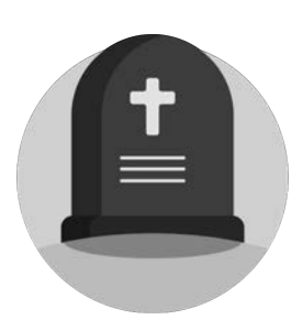
death of a family member