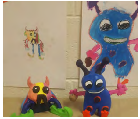
ECG students make BHS student monster drawings come to 'life'!

"Drummina to Success" Dearington & Linkhorne Elementary Schools— Kea Oboth