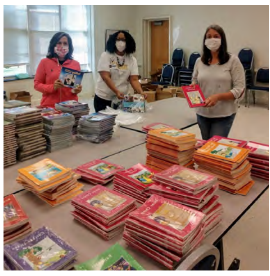
Preparing book distribution during COVID-19

The Foundation has played a very active role in responding to rapidly shifting needs and priorities by supporting our students and teachers as COVID-19 has dramatically changed the landscape of classroom instruction. The current pandemic has not only forced our schools to remodel educational delivery systems, but it has also highlighted inequities inherent in our society. As both excellence and equity are the tenets of our mission, the Education Foundation is committed to ensuring equal opportunities for success to all. So how have we responded?