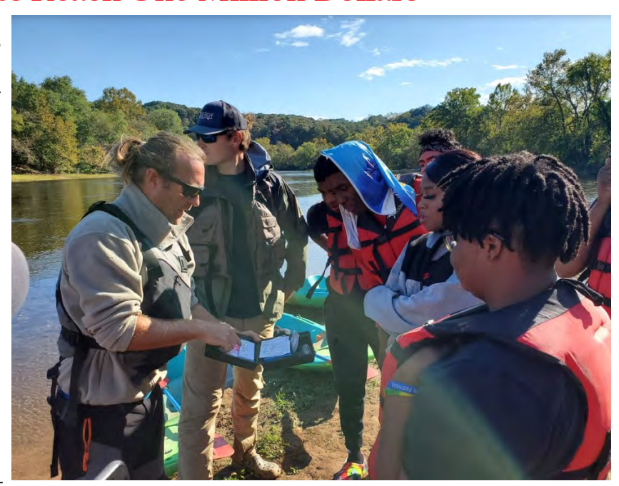
Empowerment Academy students assess water quality during a day on the James River

All Classroom Innovation Grants are funded by taxdeductible donations from businesses, foundations, and individuals. Thank you to all of the teachers listed below for going the extra mile for our students and to our donors for making this program a wonderful success! If you are not already a contributor,